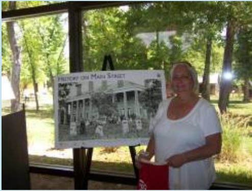
Cherokee Heritage Center