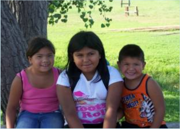
Lakota Sioux Indian Reservation