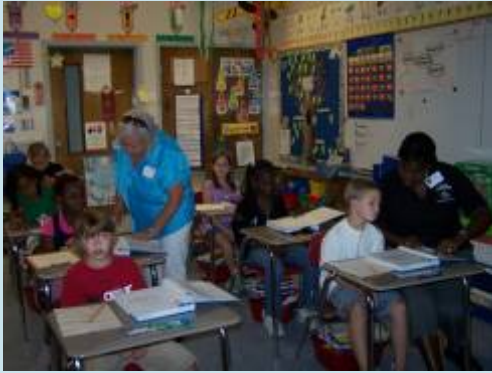
3 rd Grade Classroom