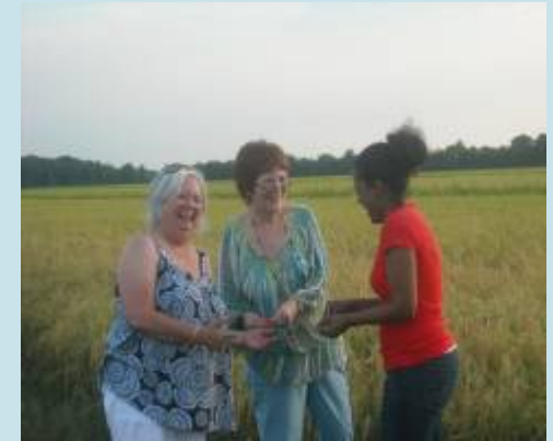
Rice fields after my first catfish