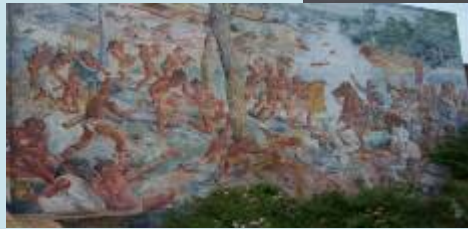
Town of Murals