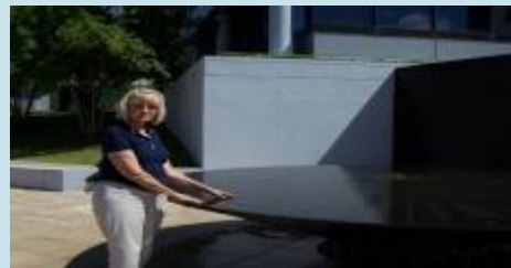
Civil Rights Memorial