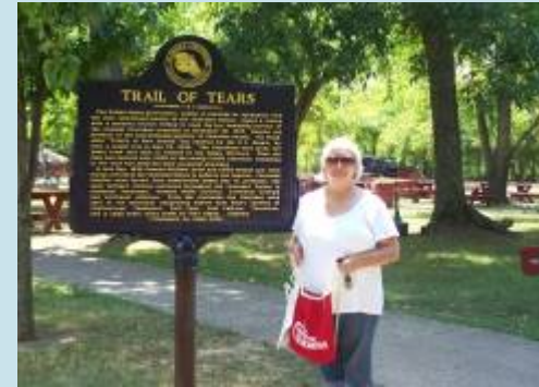
The end of the Trail of Tears