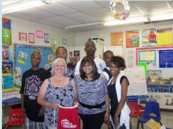
2011 & 2012 Class Officers