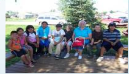
Dupree, South Dakota