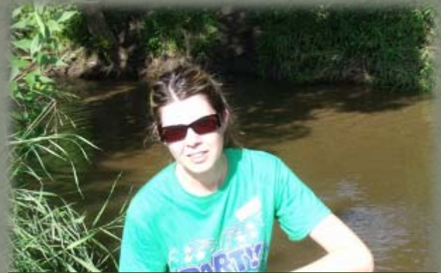
Plum Creek Walnut Grove, Minnesota