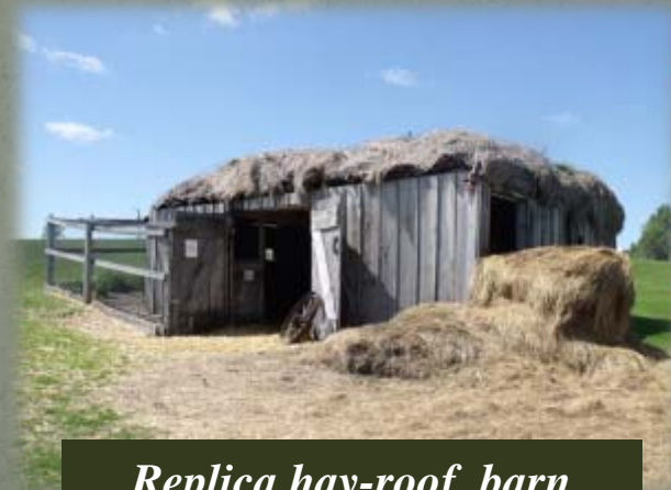
Replica hay-roof barn DeSmet, South Dakota