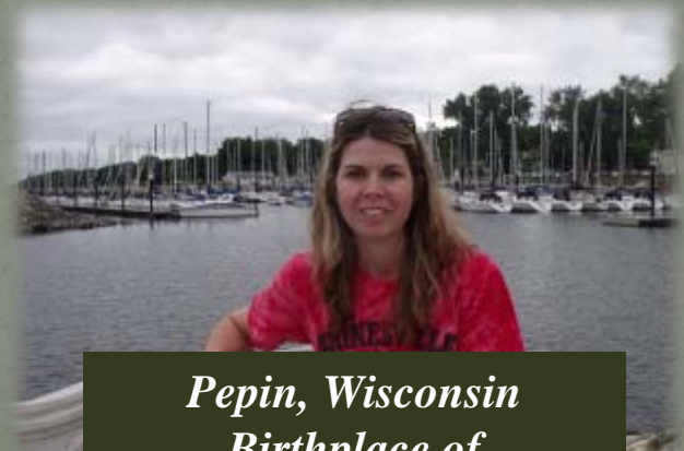
Pepin, Wisconsin Birthplace of Laura Ingalls Wilder